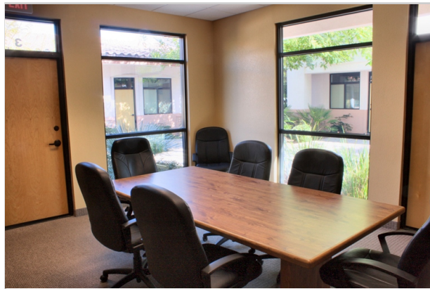
Union Hills Centre - Suites